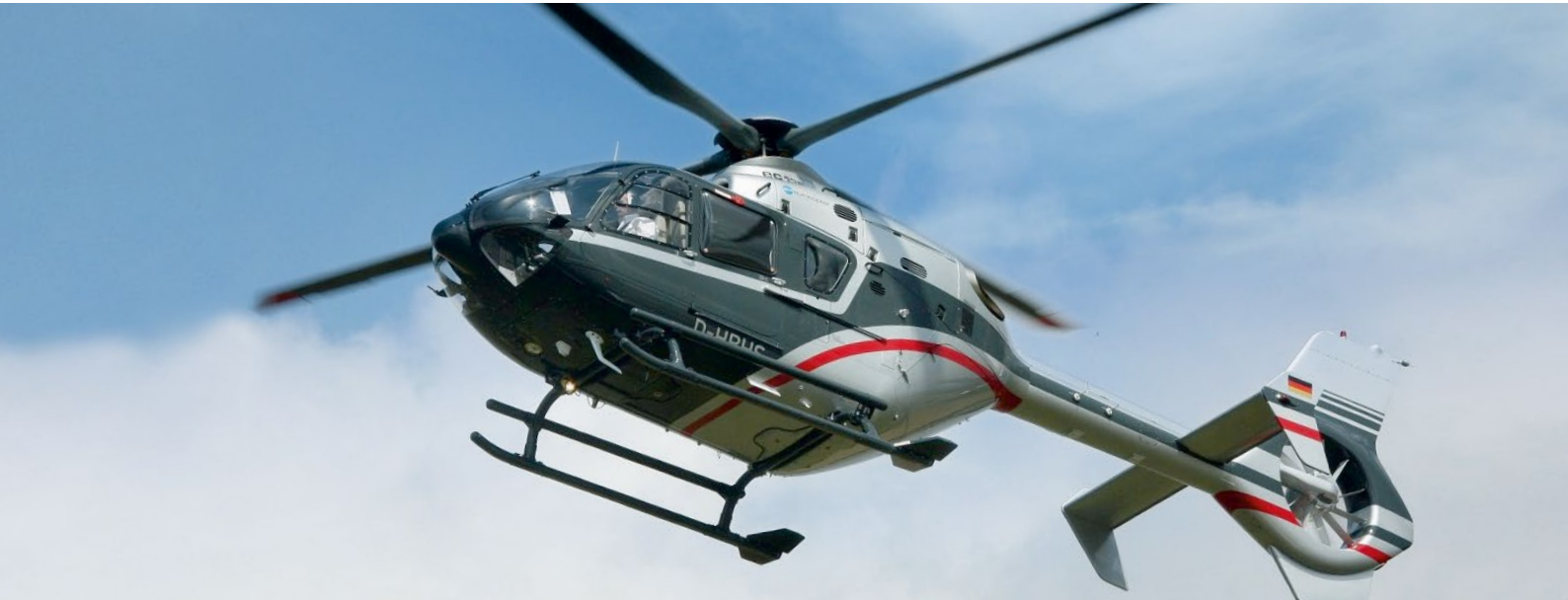
Airbus Helicopters EC135